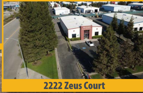
2222 Zeus Court