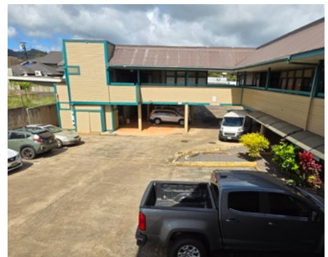
CUSHMAN & WAKEFIELD CHANEYBROOKS