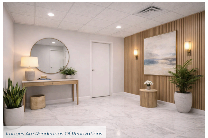
Images Are Renderings Of Renovations