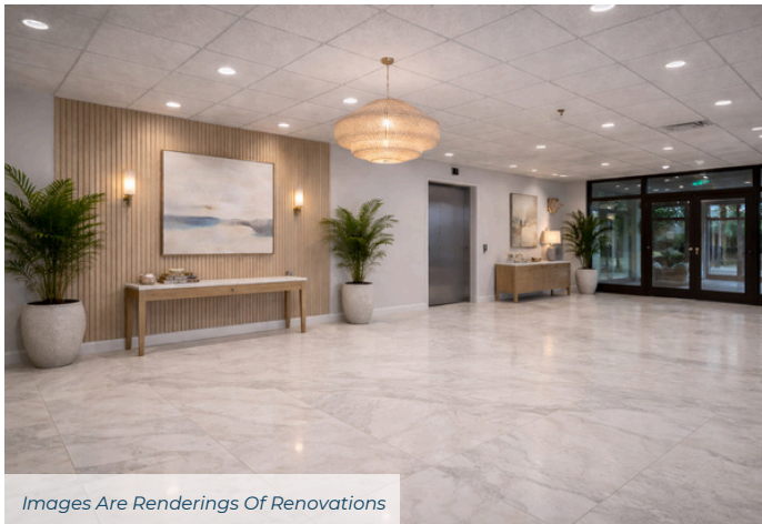
Images Are Renderings Of Renovations