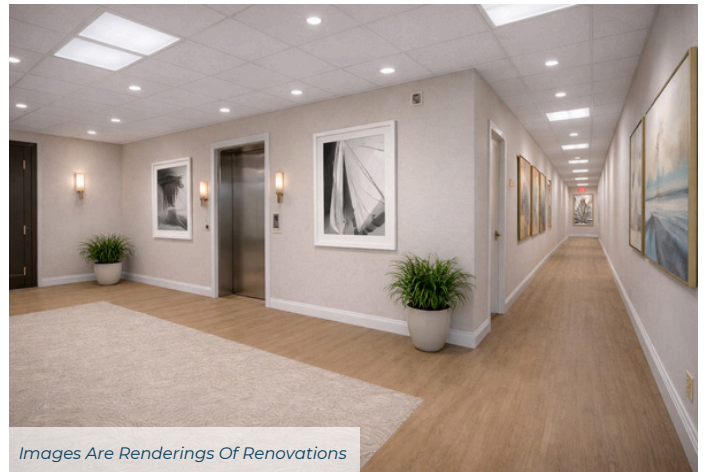
Images Are Renderings Of Renovations