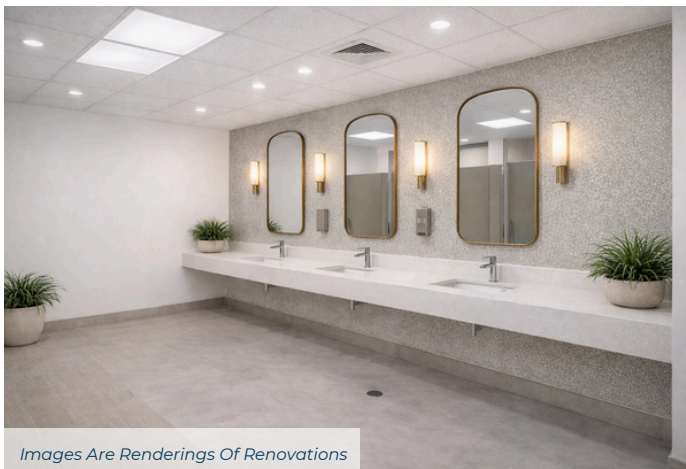
Images Are Renderings Of Renovations