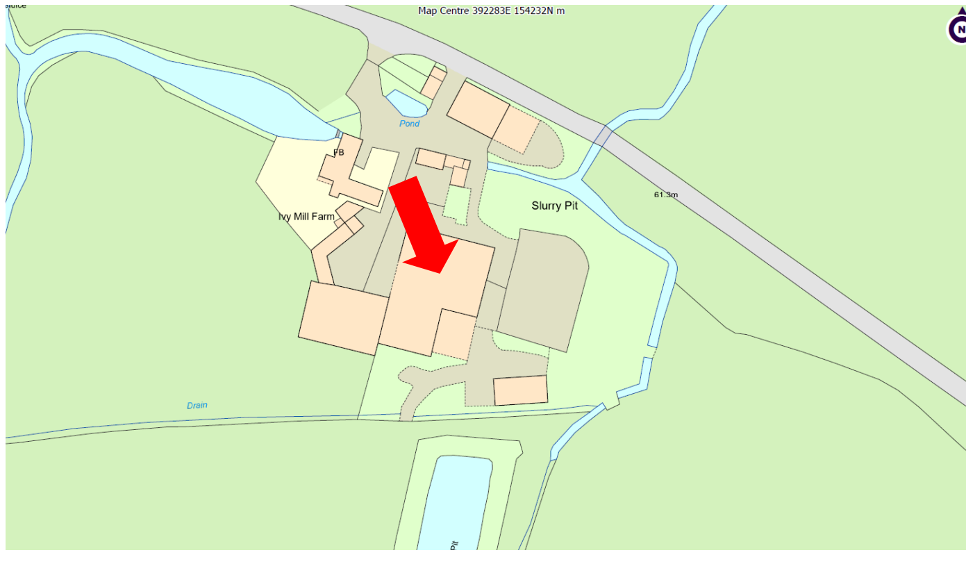
For Identification Purposes Only