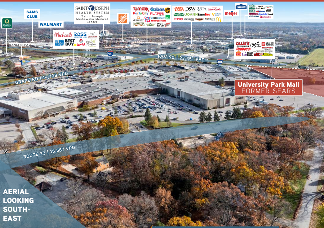
AERIAL LOOKING SOUTH- EAST