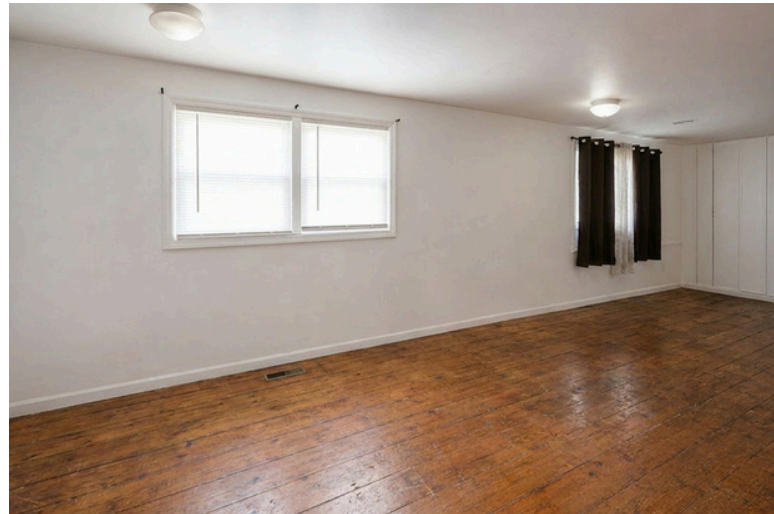
Private Office 1