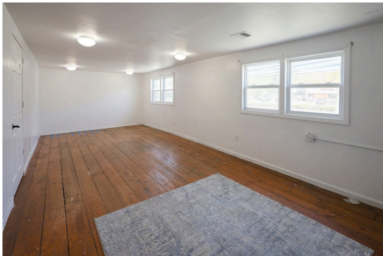
Private Office 3