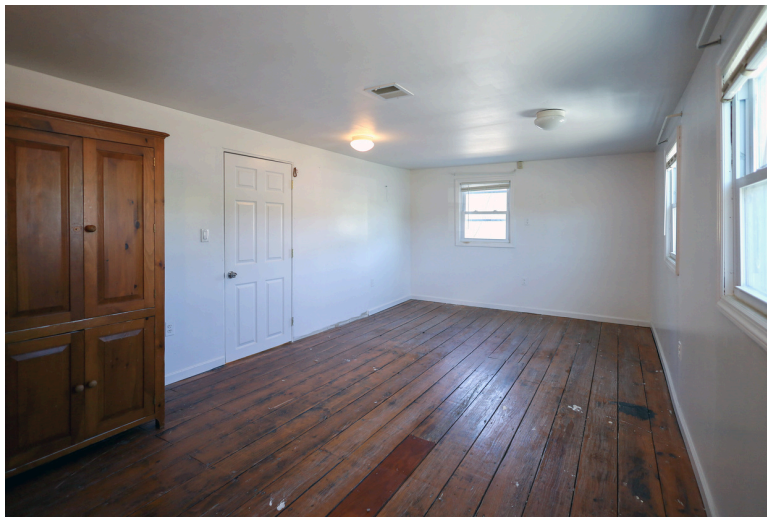
Private Office 2