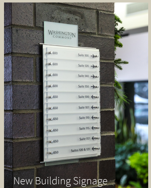
New Building Signage