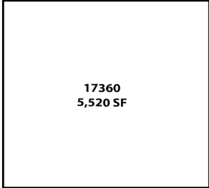
CLEAR LAKE II Tenant Roster