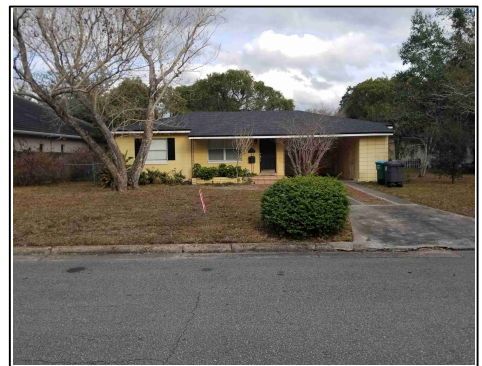
230 STRATHY LANE, WINTER PARK, FLORIDA 32792

ROSSI REAL ESTATE HOLDINGS, LLC; ALOMA TITLE COMPANY; OLD REPUBLIC NATIONAL TITLE INSURANCE COMPANY; WINTER PARK NATIONAL BANK