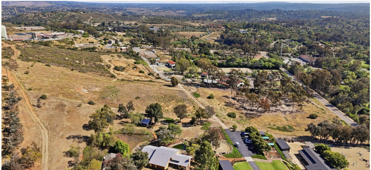
The site set between two established equestrian facilities, with the San Dieguito valley beyond

Miles of horse and hiking trails thread the surrounding land, and Escondido Creek is within walking distance. The site feeds the acclaimed Rancho Santa Fe School District, including R. Roger Rowe and Torrey Pines High. The Village of Rancho Santa Fe, fine dining, championship golf, and the coast at Del Mar and Solana Beach are all a short drive away, with San Diego and its airport roughly thirty five minutes out.