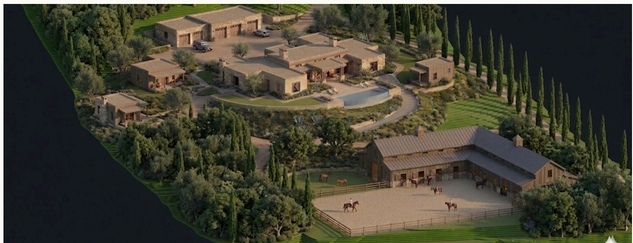
Conceptual Rendering · estate and equestrian facility with golf and valley views