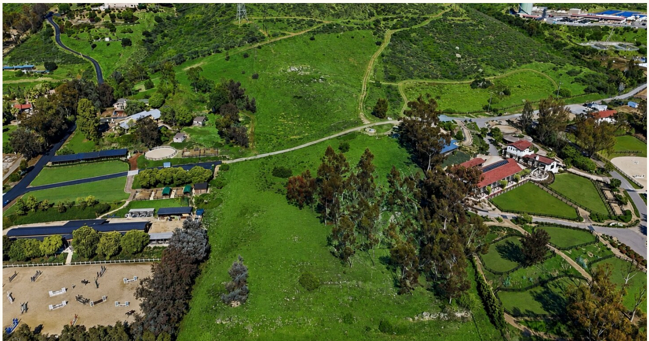
The 10.12 acre site in spring, set between two established equestrian estates