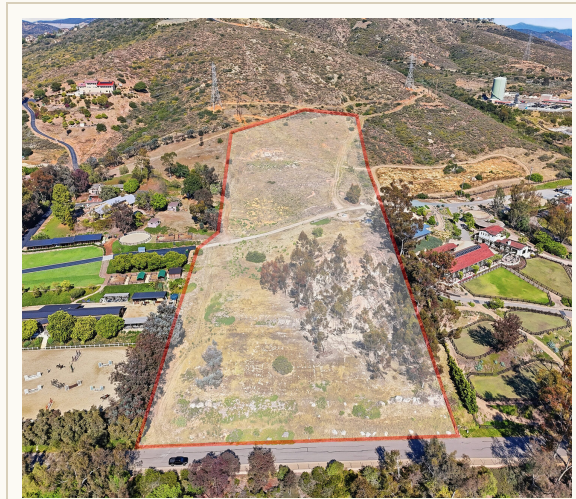
Approximate parcel boundary