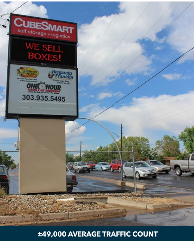
±49,000 AVERAGE TRAFFIC COUNT