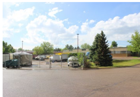
SECURED FENCED/GATED YARD