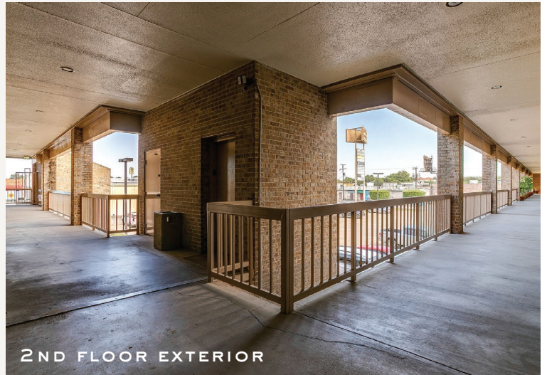
2ND FLOOR EXTERIOR