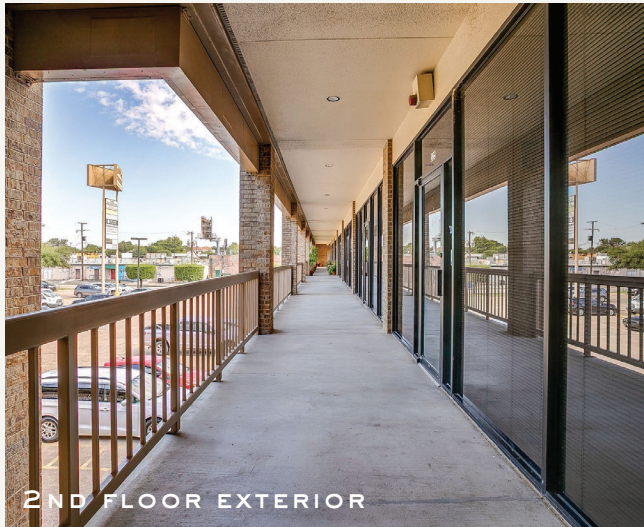
2ND FLOOR EXTERIOR