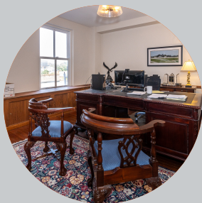
DIVISIBLE OFFICE CONDOS