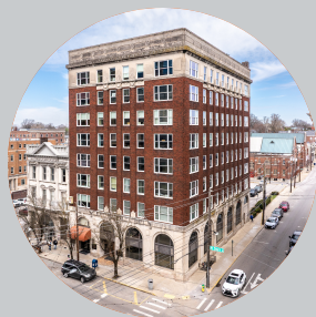
HISTORIC DOWNTOWN LOCATION