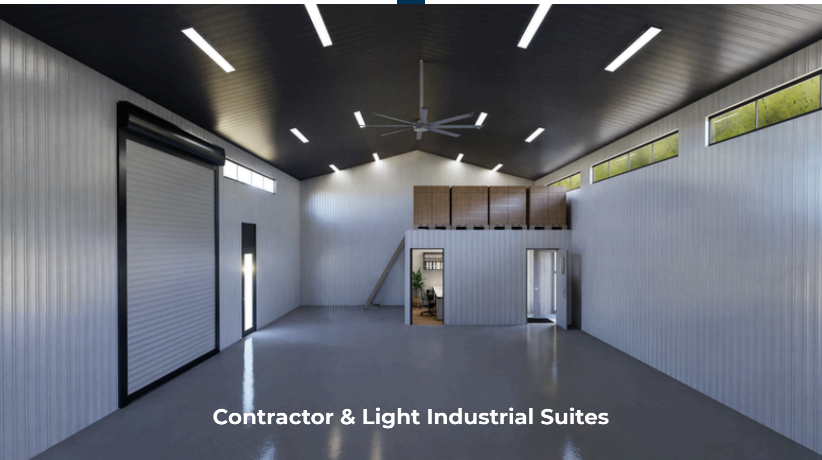
Contractor & Light Industrial Suites