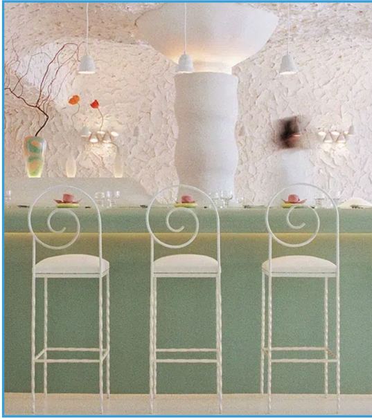
CENTO RAW BAR