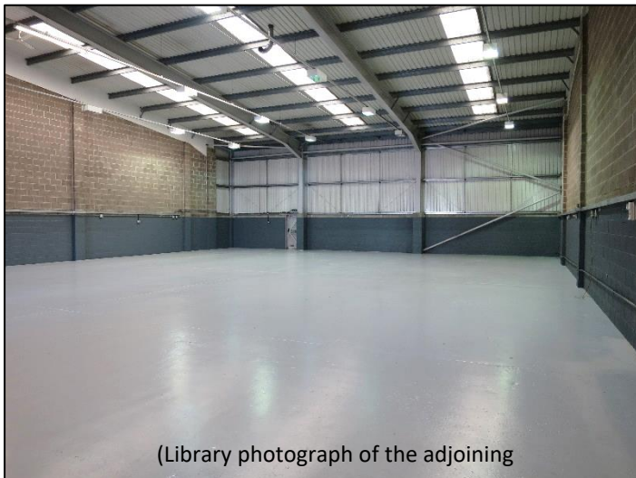
(Library photograph of the adjoining

Up and over entrance door from courtyard area offering good vehicular access to the warehouse. Glazed door with glazed side panel. Translucent roof panels. Minimum eaves 5.3m (17'3") with a maximum in the centre of 6.92m (22'8")