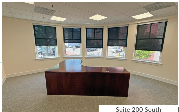
Suite 200 South