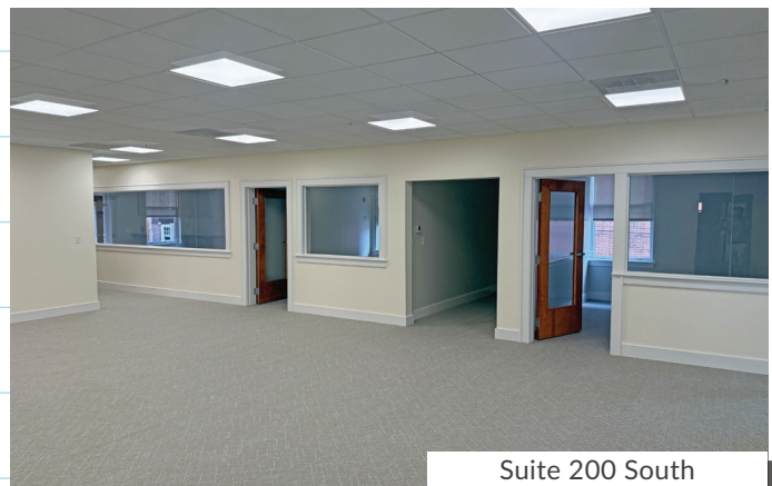
Suite 200 South