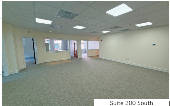
Suite 200 South