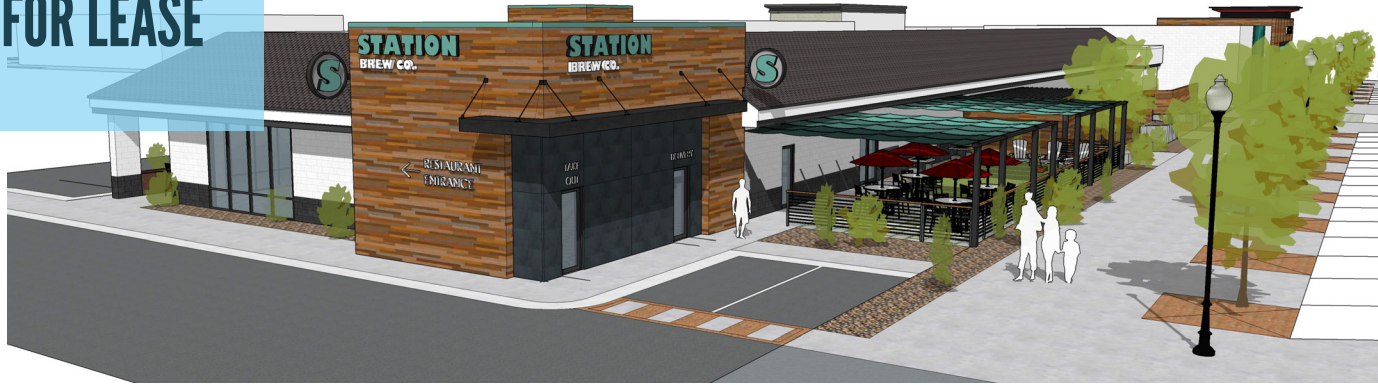
SOUTHWEST VIEW & PATIO AREA