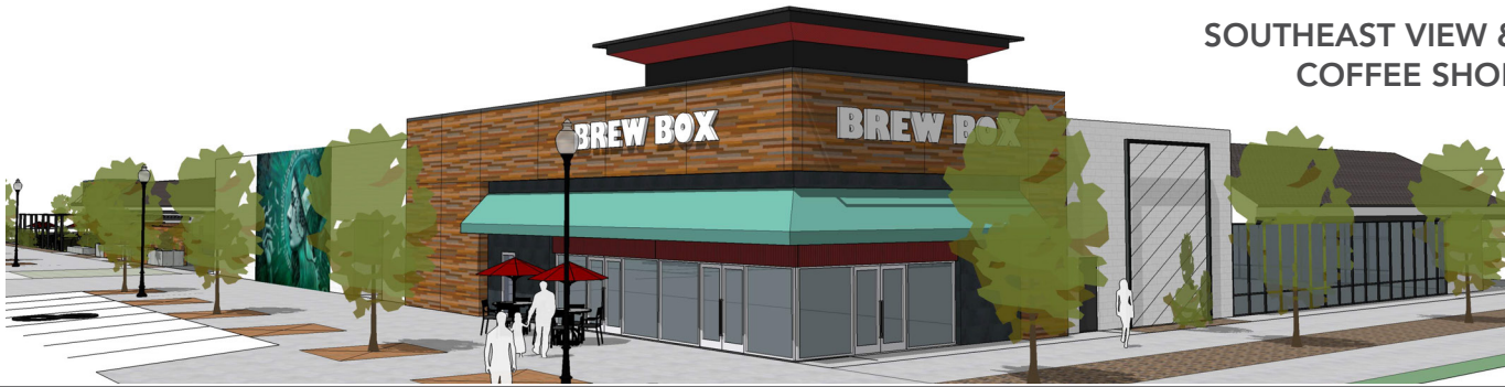
SOUTHEAST VIEW & COFFEE SHOP