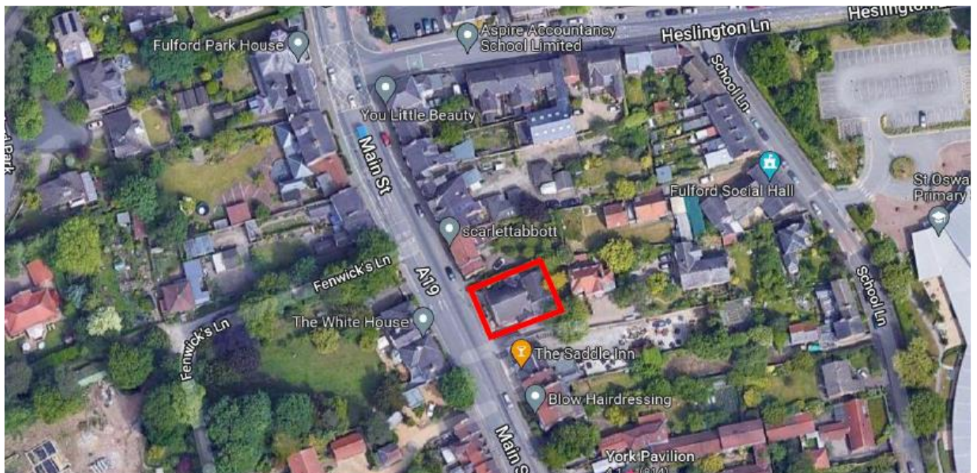
Indicative boundary only. Not to be relied on

IMPORTANT NOTICE McBeath Property Consultancy Ltd, their clients and any joint agents give notice that: They have no authority to make or give any representations or warranties in relation to the property. These particulars do not form part of any offer or contract and must not be relied upon as statements or representations of fact. Any areas, measurements or distances are approximate. The text, photographs and plans are for guidance only and are not necessarily comprehensive. It should not be assumed that the property has all necessary planning, building regulation or other consents and McBeath Property Consultancy Ltd have not tested any services, equipment or facilities. Purchasers must satisfy themselves by inspection or otherwise.