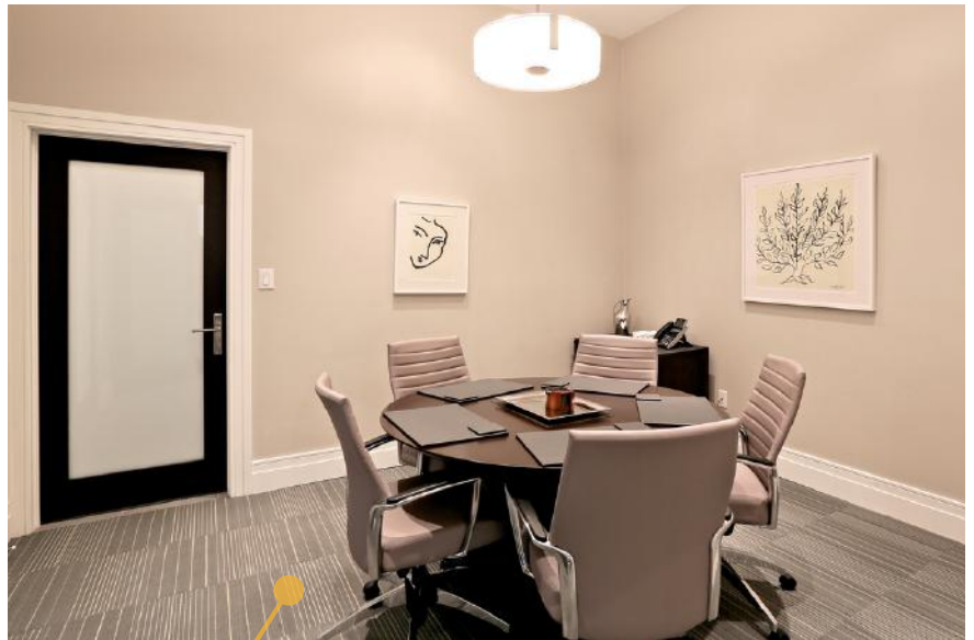
Spacious meeting rooms