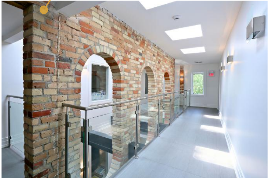
Exposed brick throughout