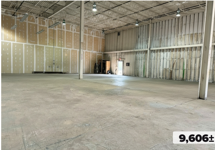
9,606± SF UNIT