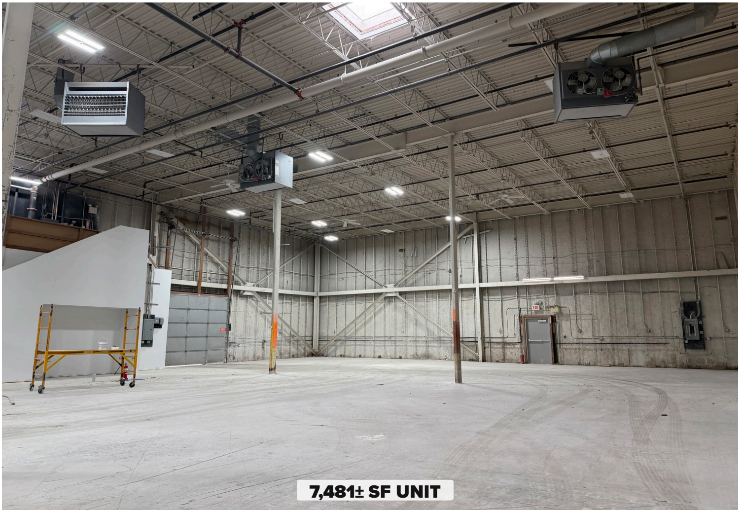
7,481± SF UNIT

UNITS CAN BE COMBINED FOR UP TO 17,087± SF INDUSTRIAL SPACE