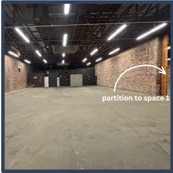
740 Warehouse space 2