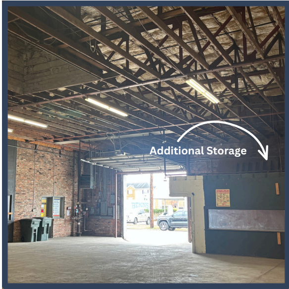
740 Warehouse space 1