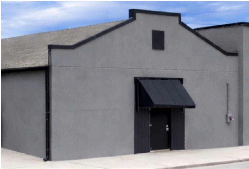
CONCEPTUAL RENDERING OF EXTERIOR IMPROVEMENTS