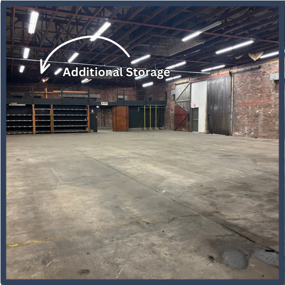
740 Warehouse space 1