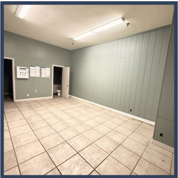
Break Room w/ bathroom