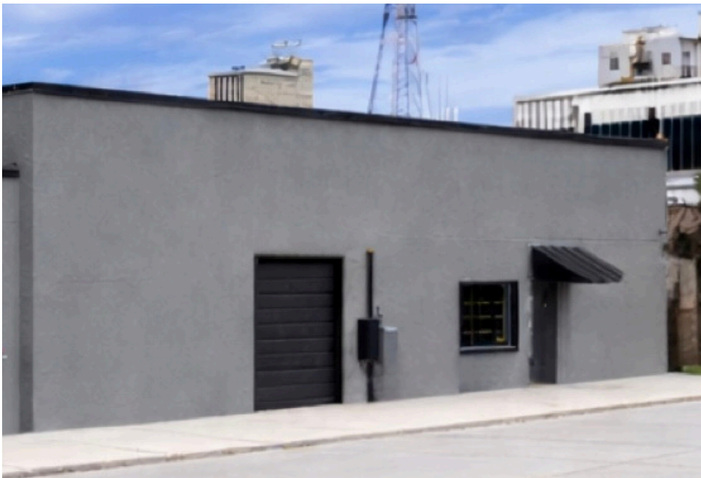
CONCEPTUAL RENDERING OF EXTERIOR IMPROVEMENTS

COLDWELL BANKER COMMERCIAL ARNOLD AND ASSOCIATES