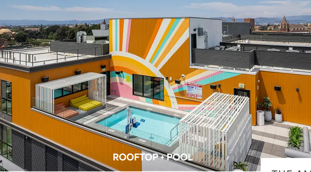
ROOFTOP + POOL