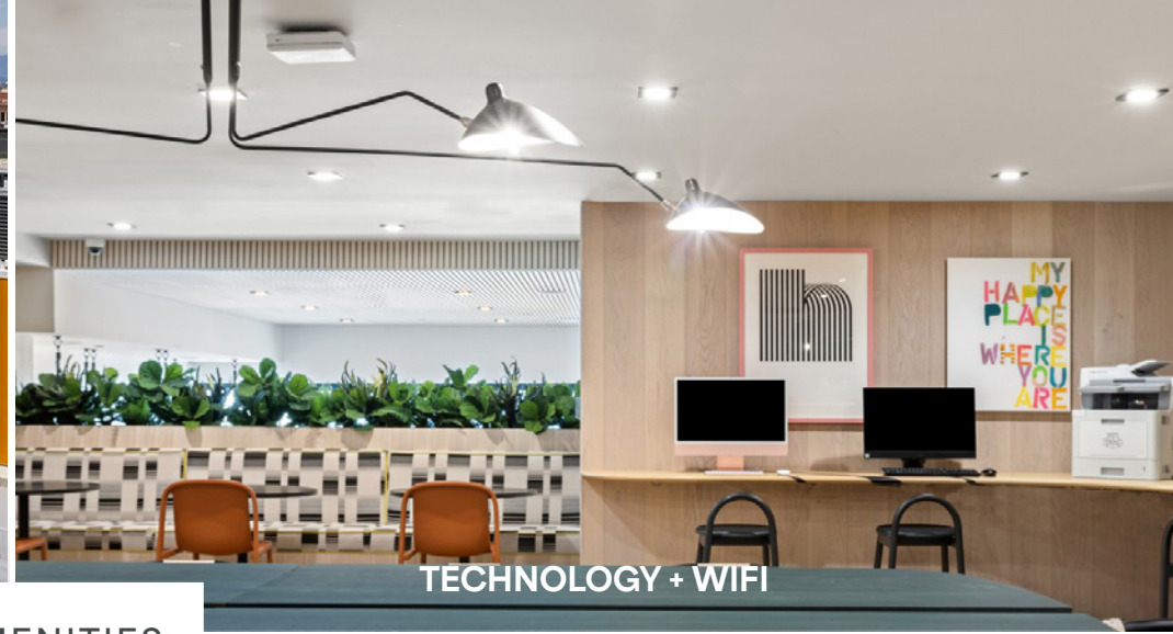
TECHNOLOGY + WIFI