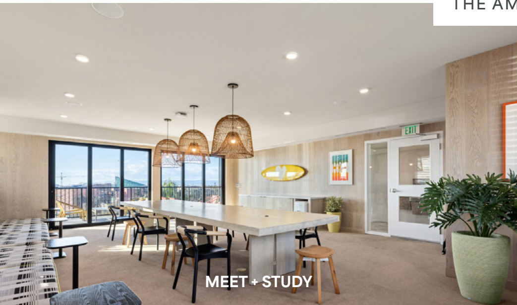
MEET + STUDY