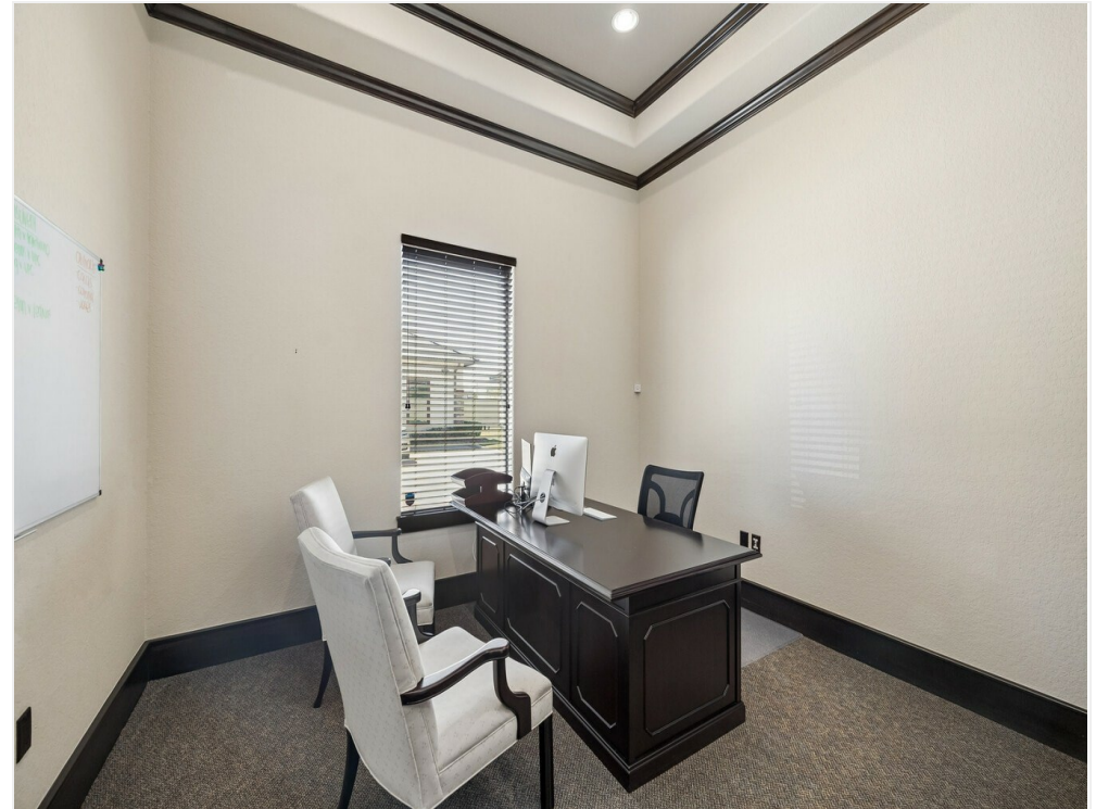
Furniture in all offices conveys