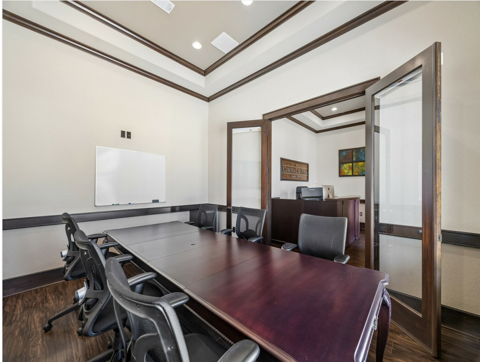
Conference room with 6 person table conveys