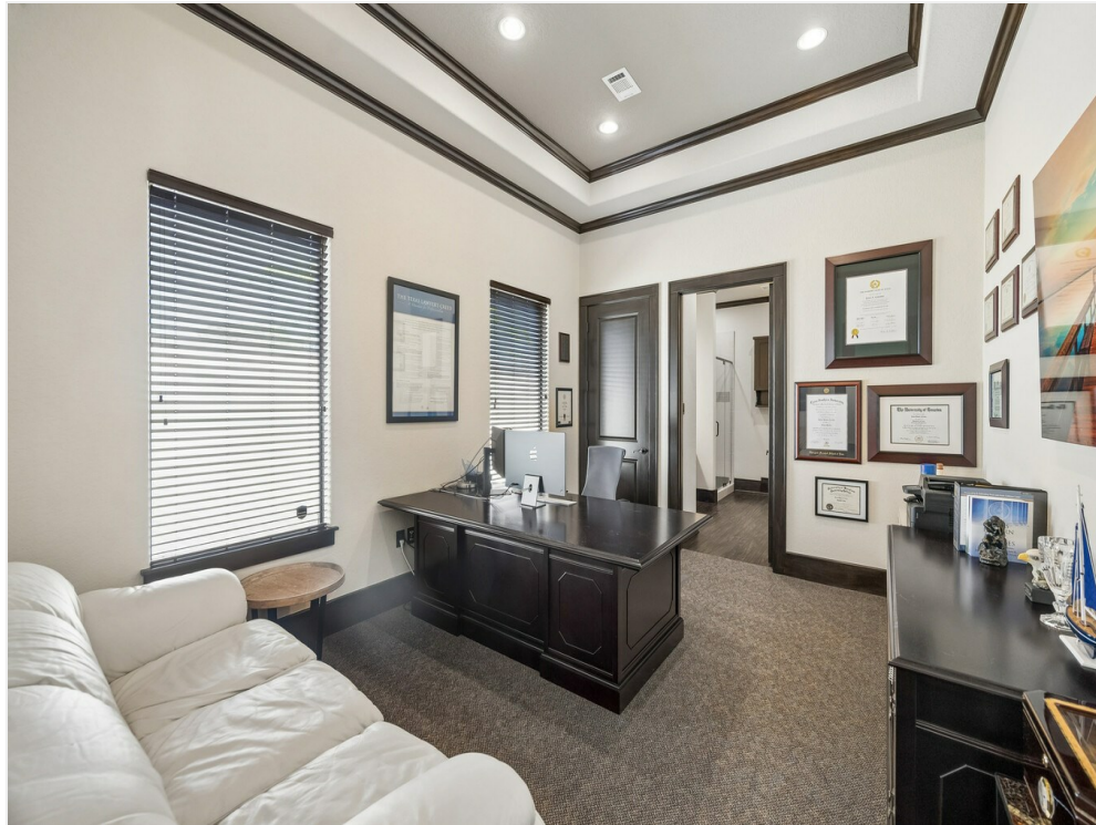
Executive office with private bathroom