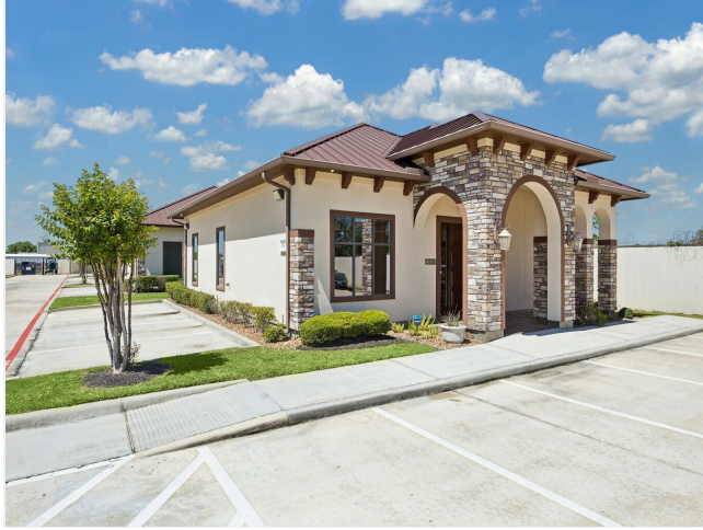
6 assigned parking spots in front