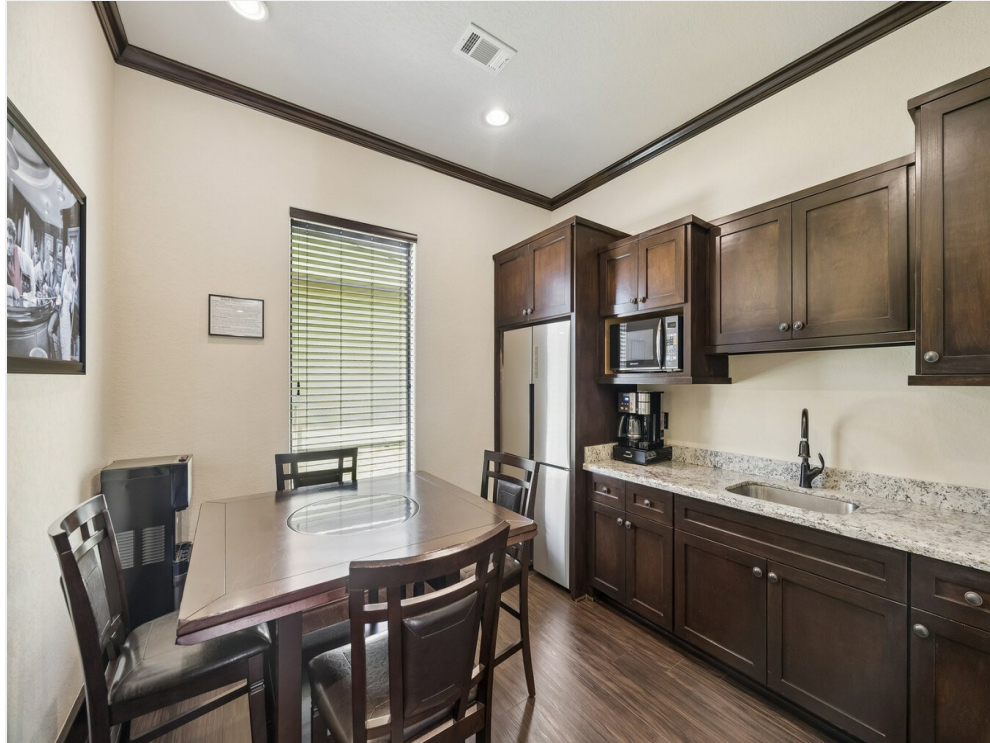
Breakroom with sitting area