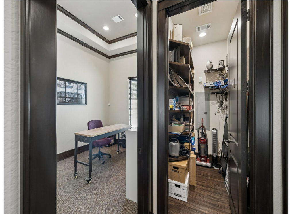
Ample storage/IT closet