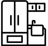
Large Kitchen/Break Area