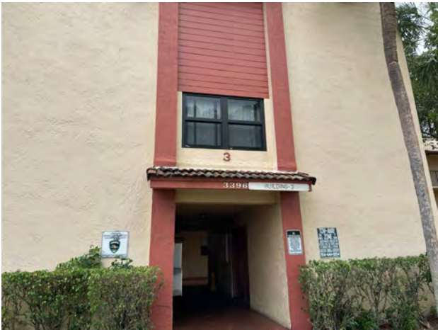
GENERAL VIEW OF BUILDING EXTERIOR FINISHES