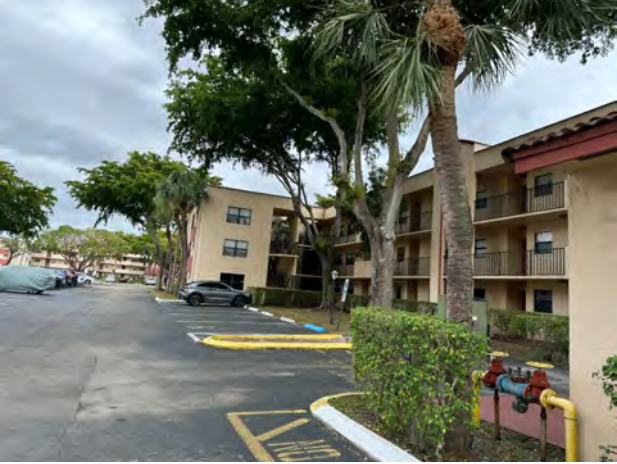
GENERAL VIEW OF PROPERTY