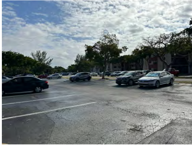
GENERAL VIEW OF TYPICAL PARKING AREA