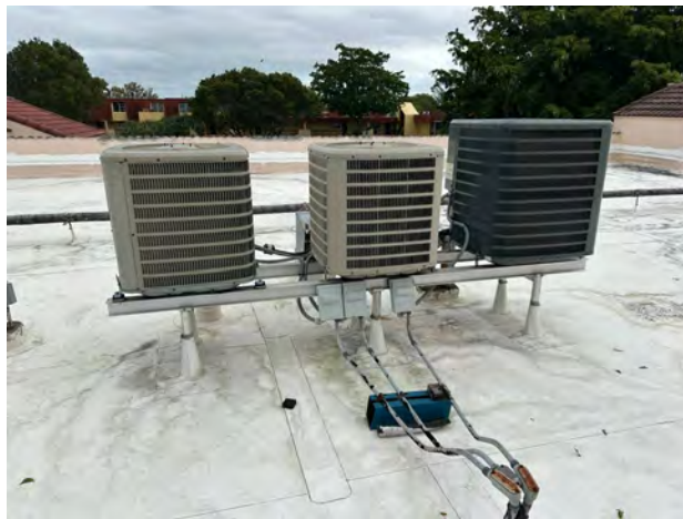
VIEW OF HVAC EQUIPMENT