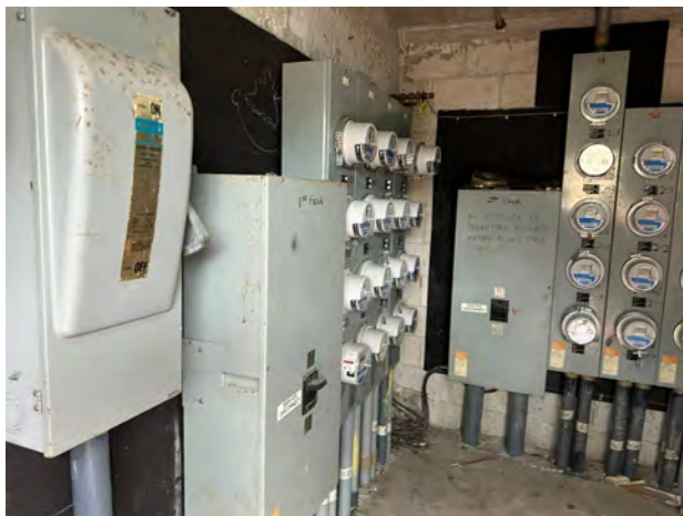
VIEW OF ELECTRICAL EQUIPMENT