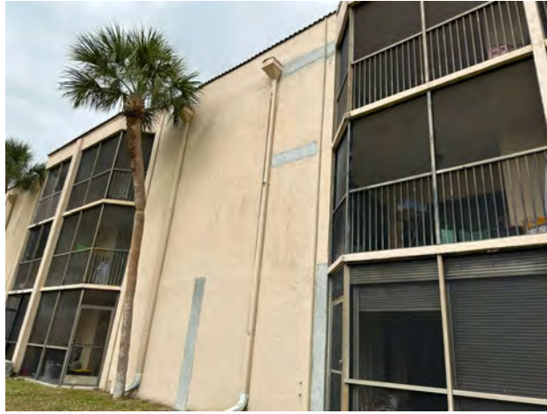
VIEW OF TYPICAL BALCONY