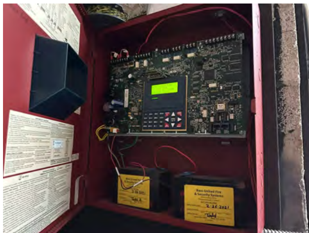
GENERAL VIEW OF FIRE ALARM PANEL