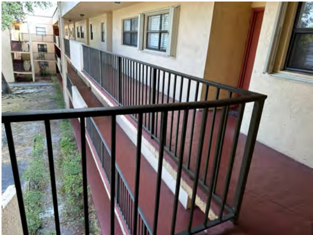
GENERAL VIEW OF ELEVATED WALKWAY