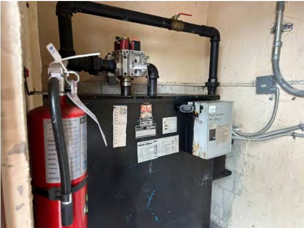
VIEW OF TYPICAL ELEVATOR PUMP