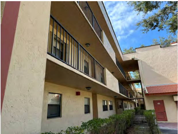
VIEW OF BUILDING EXTERIOR FINISHES