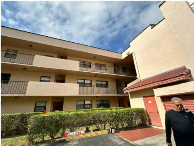
GENERAL VIEW OF BUILDING EXTERIOR FINISHES