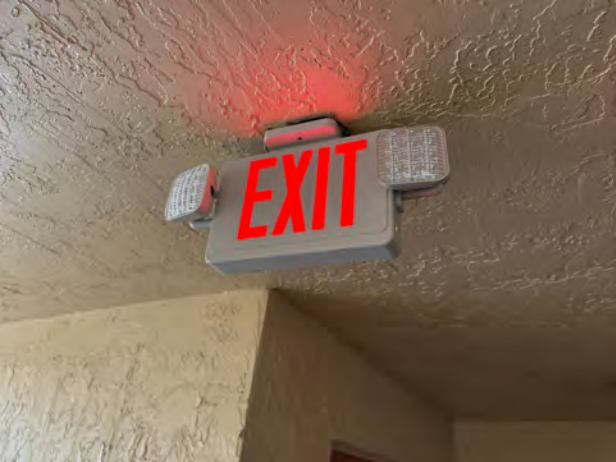
GENERAL VIEW OF EXIT LIGHTS