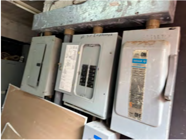
VIEW OF ELECTRICAL EQUIPMENT