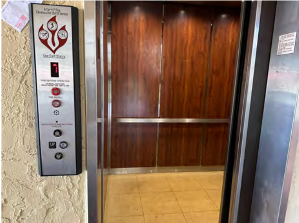
GENERAL VIEW OF ELEVATOR