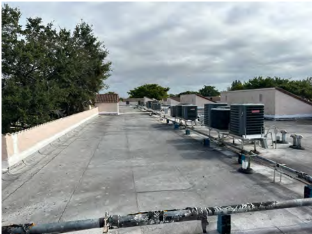
GENERAL VIEW OF TYPICAL ROOFTOP