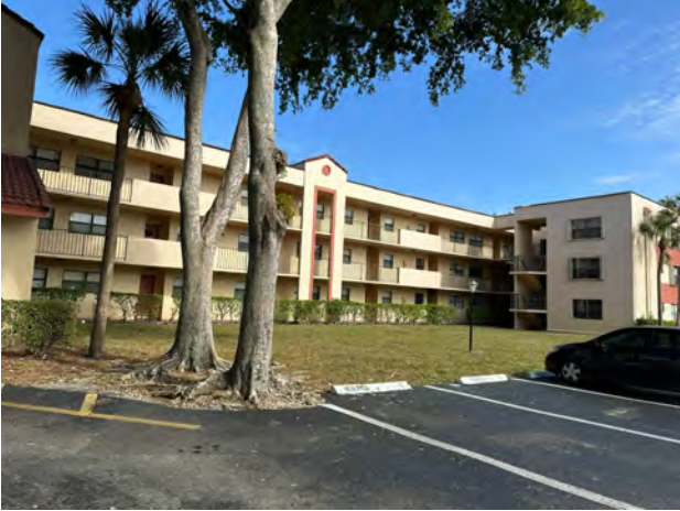
GENERAL VIEW OF PROPERTY