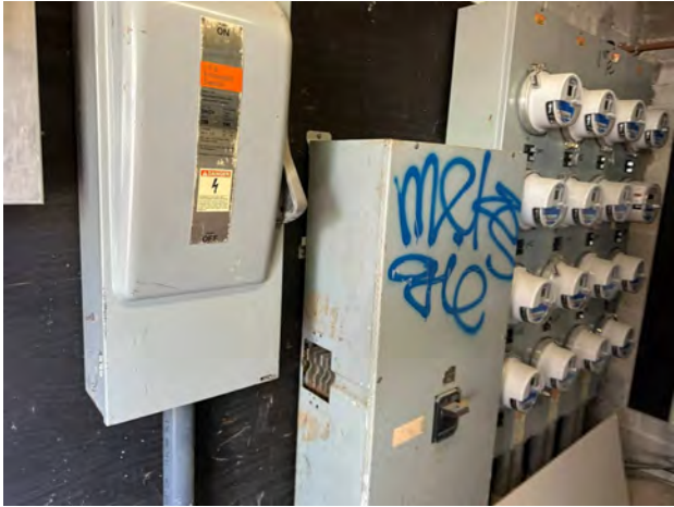
VIEW OF ELECTRICAL EQUIPMENT