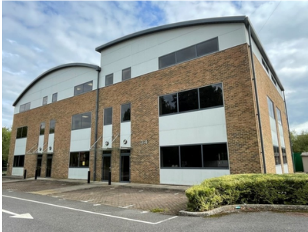
Units 1 - 4