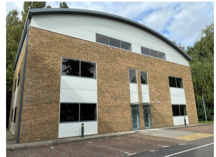
Units 10 & 11