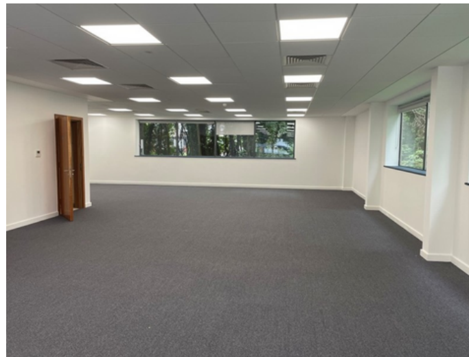
Unit 11 - Ground Floor