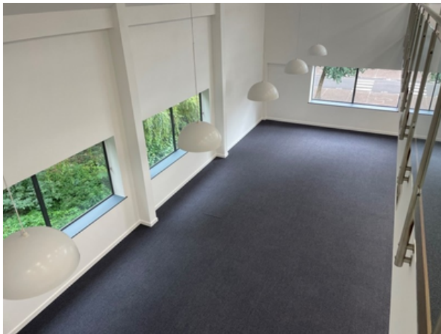
Unit 11 - First Floor