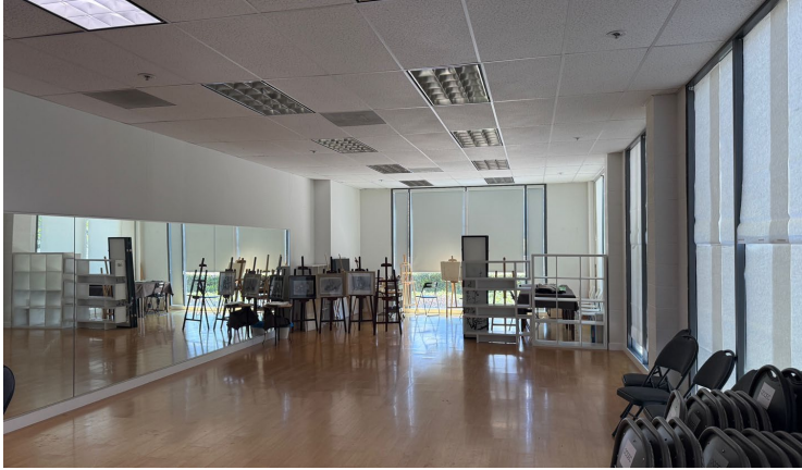
SPACE #1 – Approx. 1,350 SF (902 RSF + 448 RSF Common Area)