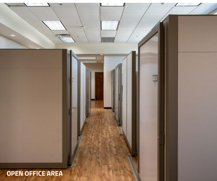
OPEN OFFICE AREA