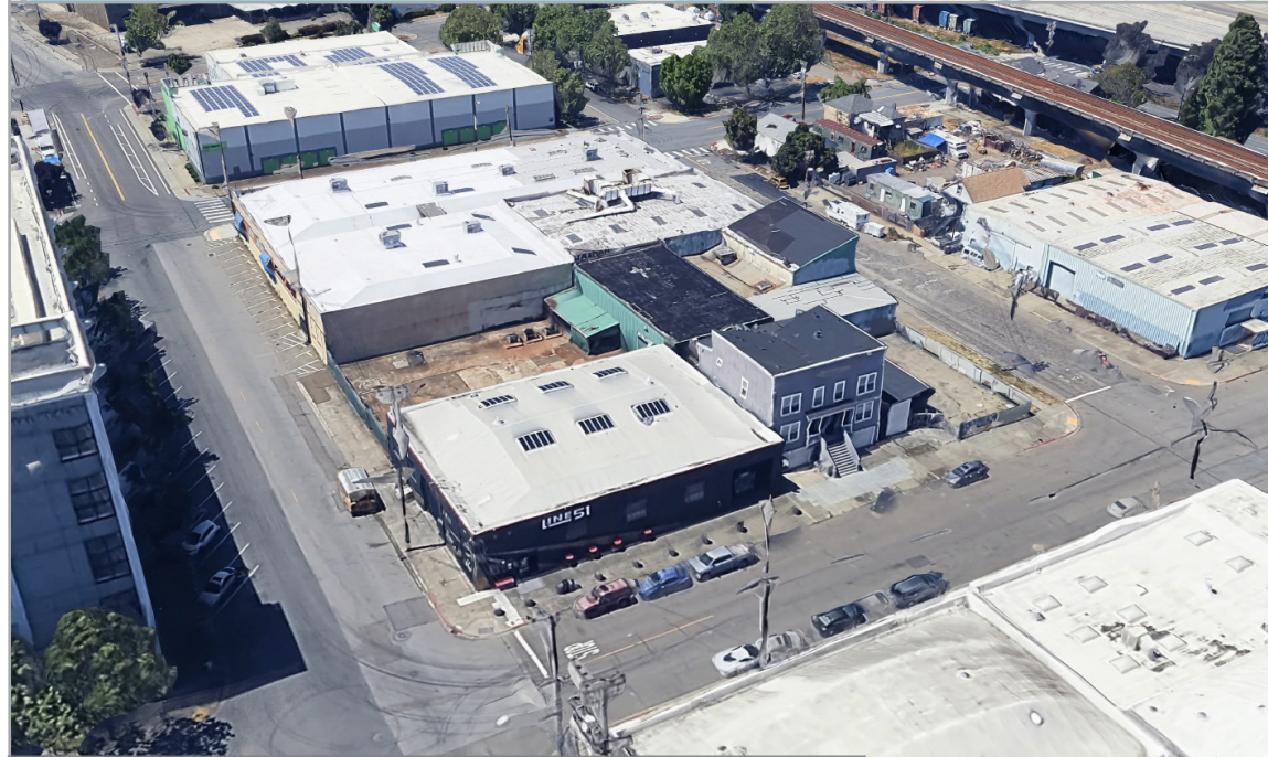
PRIME JACK LONDON SQUARE LOCATION

Lee & Associates Oakland Commercial Real Estate \ 555 12th Street, Suite 1725, Oakland, CA 94607 \ www.lee-associates.com