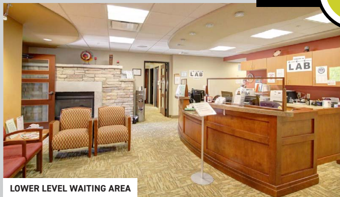
LOWER LEVEL WAITING AREA