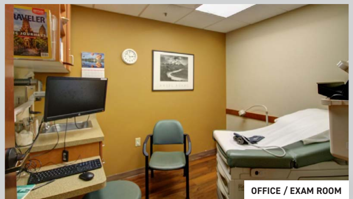
OFFICE / EXAM ROOM