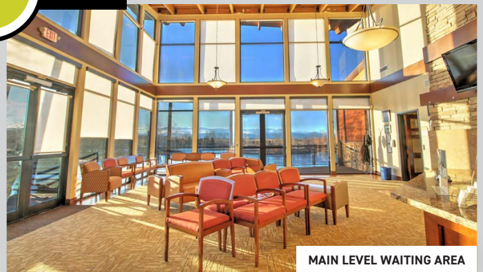
MAIN LEVEL WAITING AREA