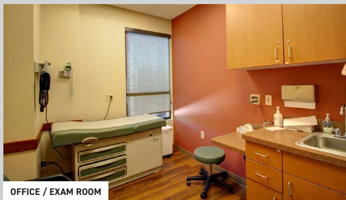
OFFICE / EXAM ROOM