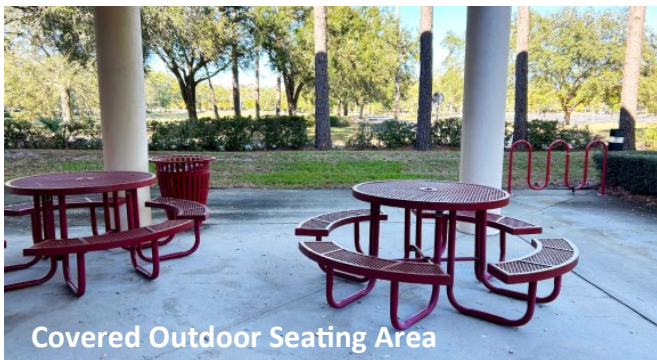
Covered Outdoor Seating Area