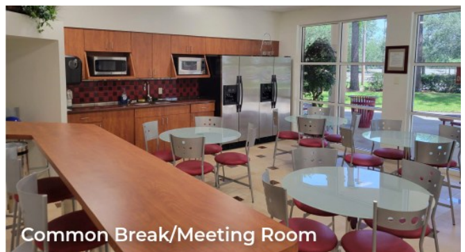
Common Break/Meeting Room