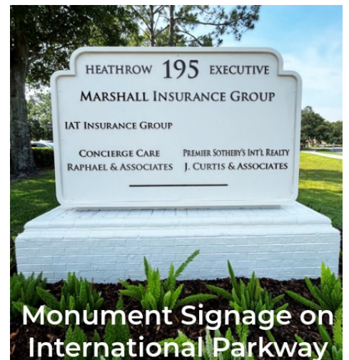
Monument Signage on International Parkway