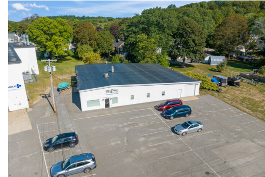
22 Oakland Street