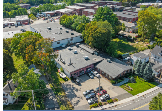
144 Elm Street