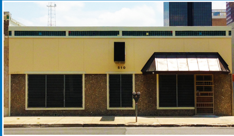
510 N. Main Street