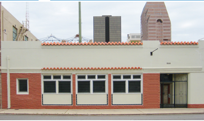
500 N. Main Street