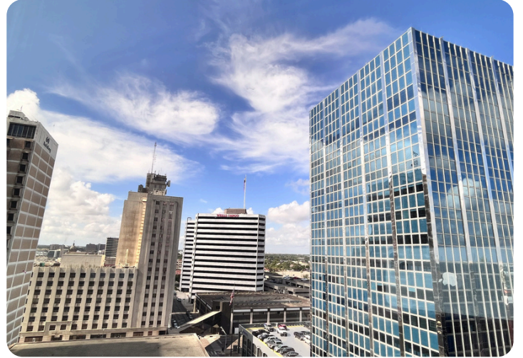
City Scape View