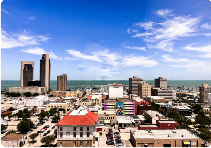
Bay Front Views