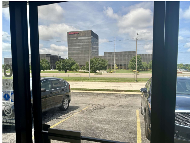
View of State Farm Headquarters from inside