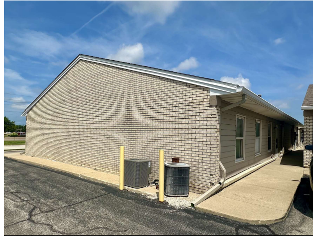
Side and back of space