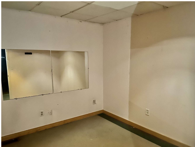
One of the office/rooms