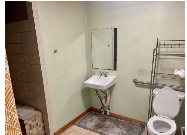
One of the full restrooms