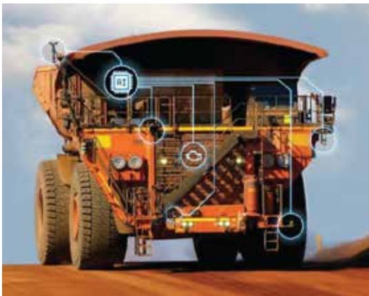
An illustration of ASI Mining’s solutions on a mine truck

Read more about ASI Mining at https://asimining.com/ .