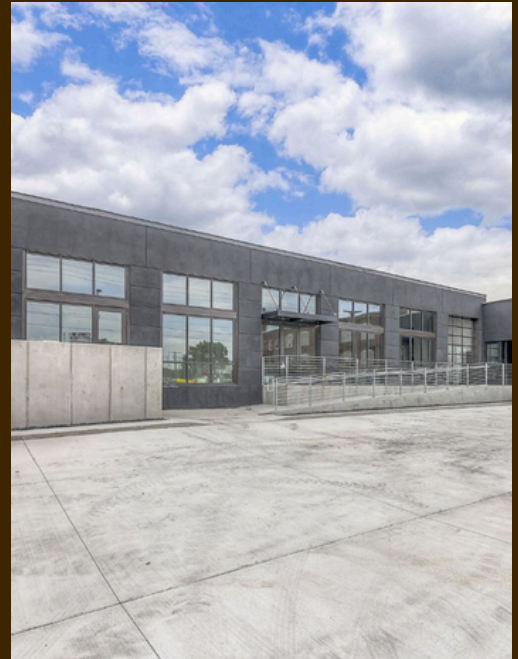
Subject Premises Photo