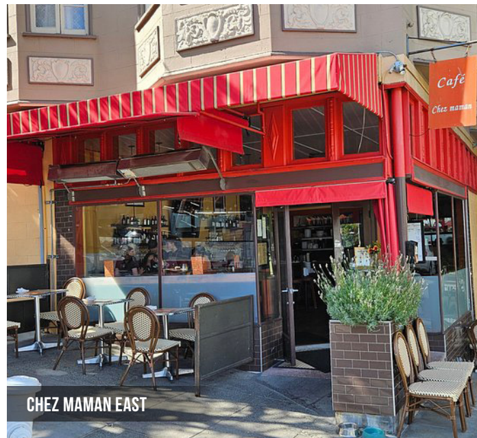
CHEZ MAMAN EAST