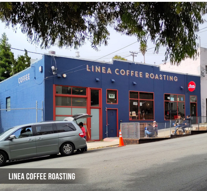
LINEA COFFEE ROASTING