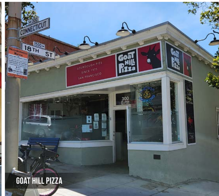
GOAT HILL PIZZA