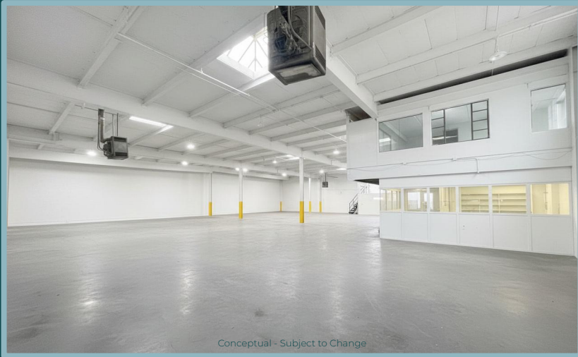
Conceptual - Subject to Change