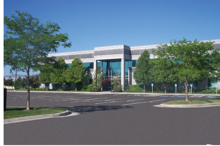
Class A Building with abundant parking