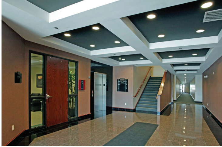
First Floor Lobby