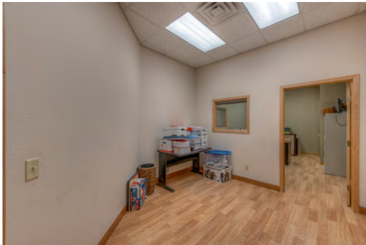
Office with reception area - reception to office