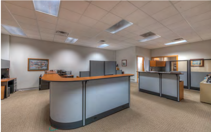
Reception and open cubicle work spaces