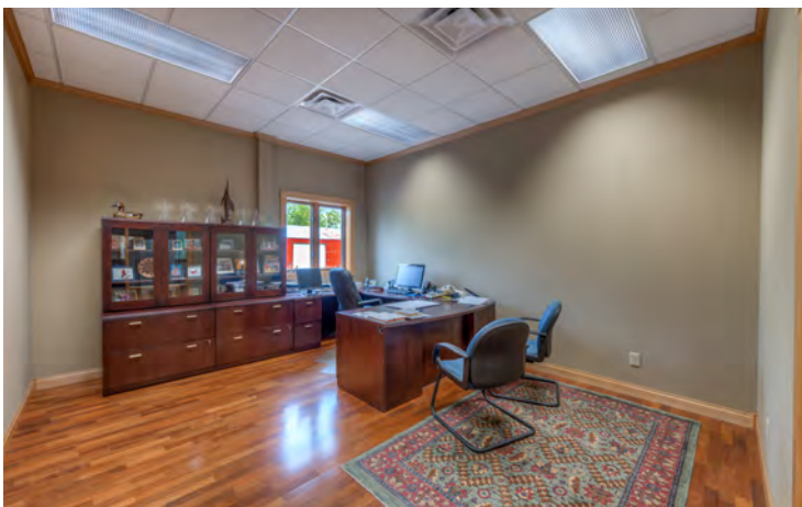
2nd of two private offices