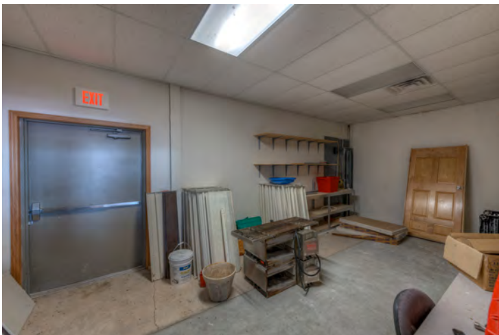
Storage room with wide door to back parking lot