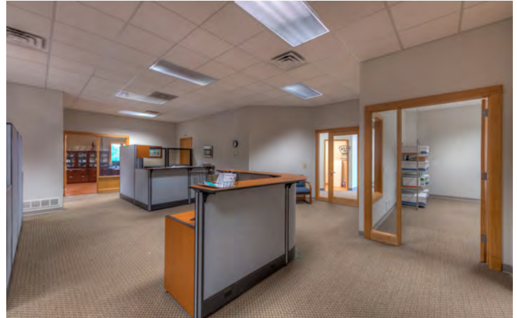
Reception with view to conference room