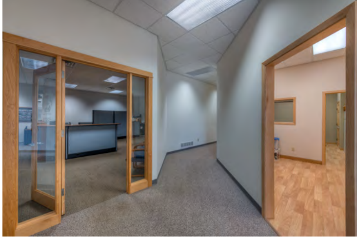
Front entrance view - multi-office on the left with office with reception area on the right