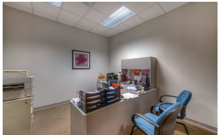
One of two private offices