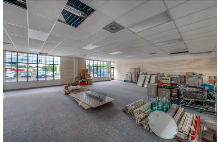
Preexisting shelf walls