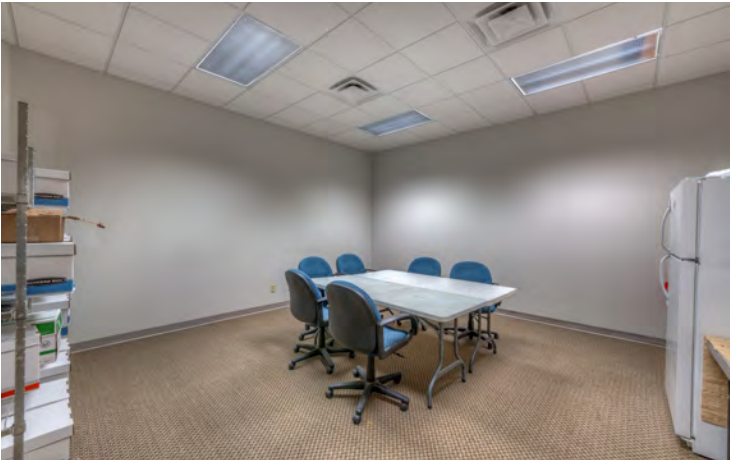
Conference room / break area