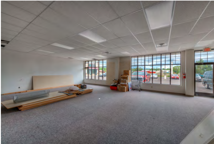
Plenty of natural light and storefront presence