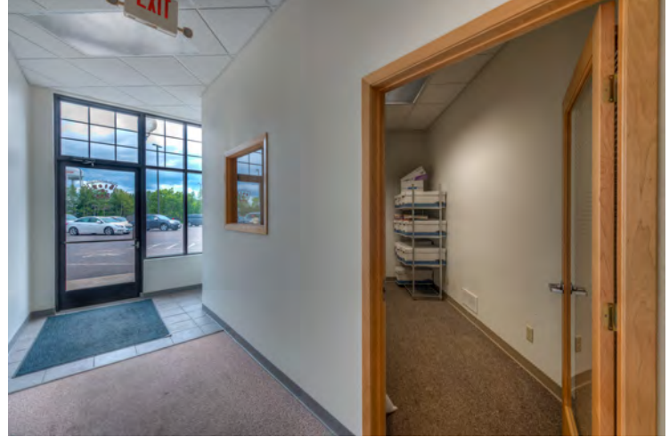
Reverse front entrance view - small, single office with window and glass door bringing in plenty of natural light