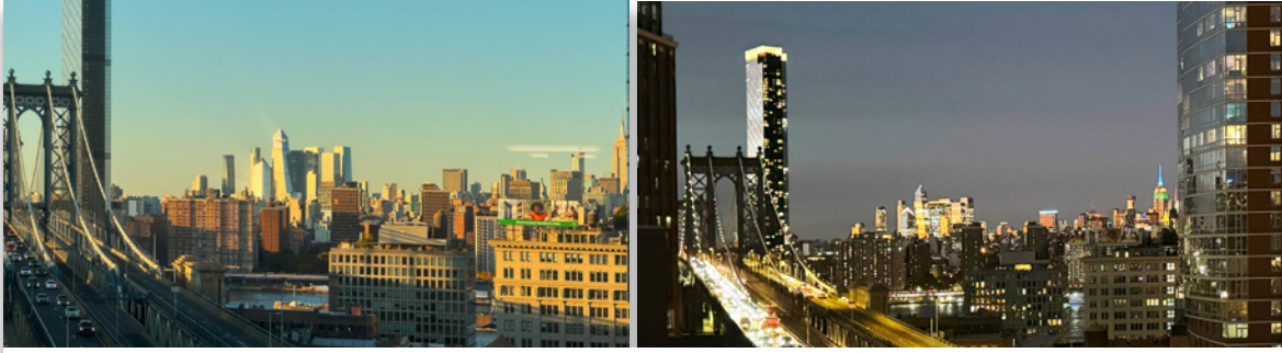
North exposure views of Midtown Manhattan