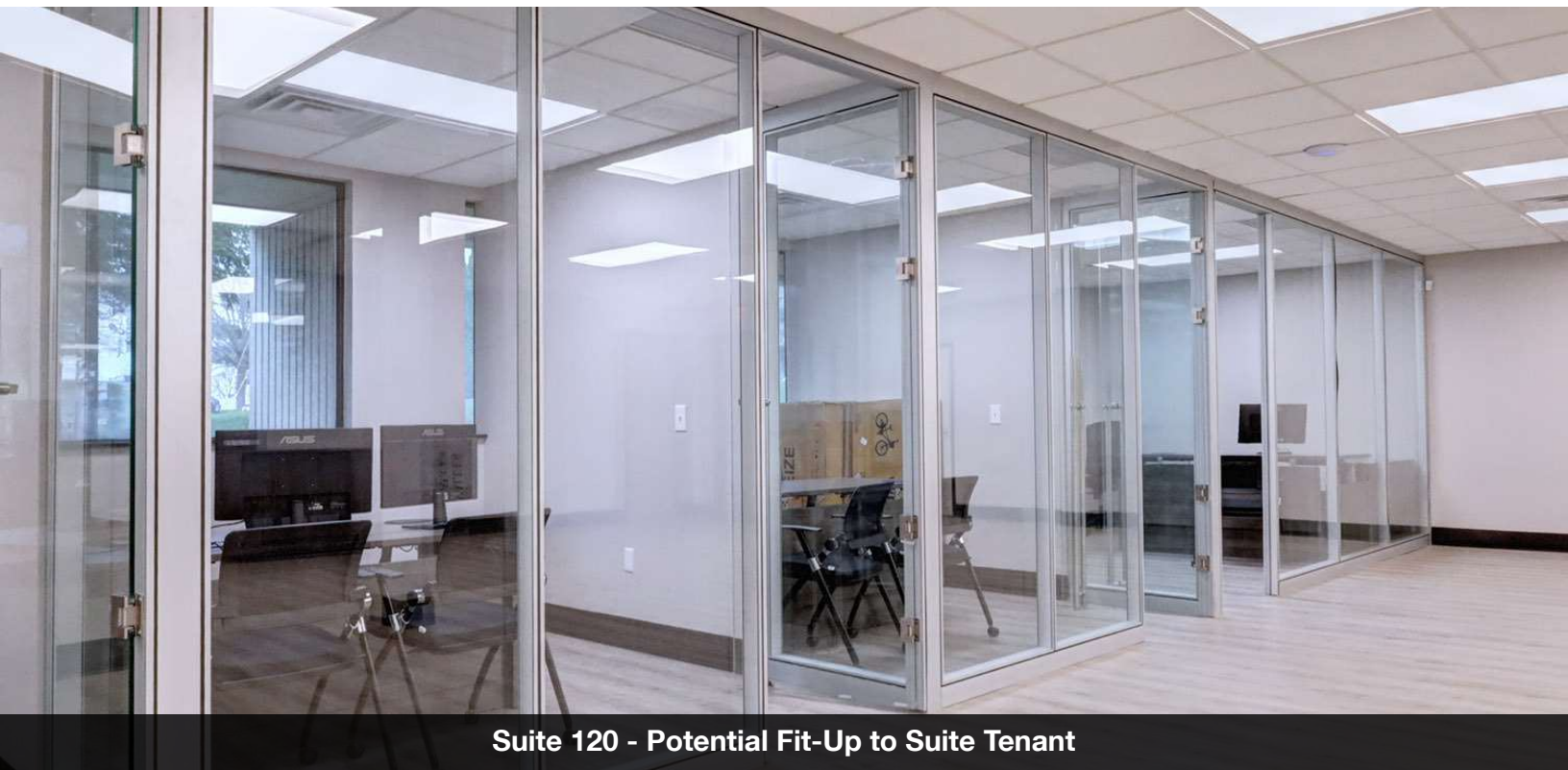
Suite 120 - Potential Fit-Up to Suite Tenant