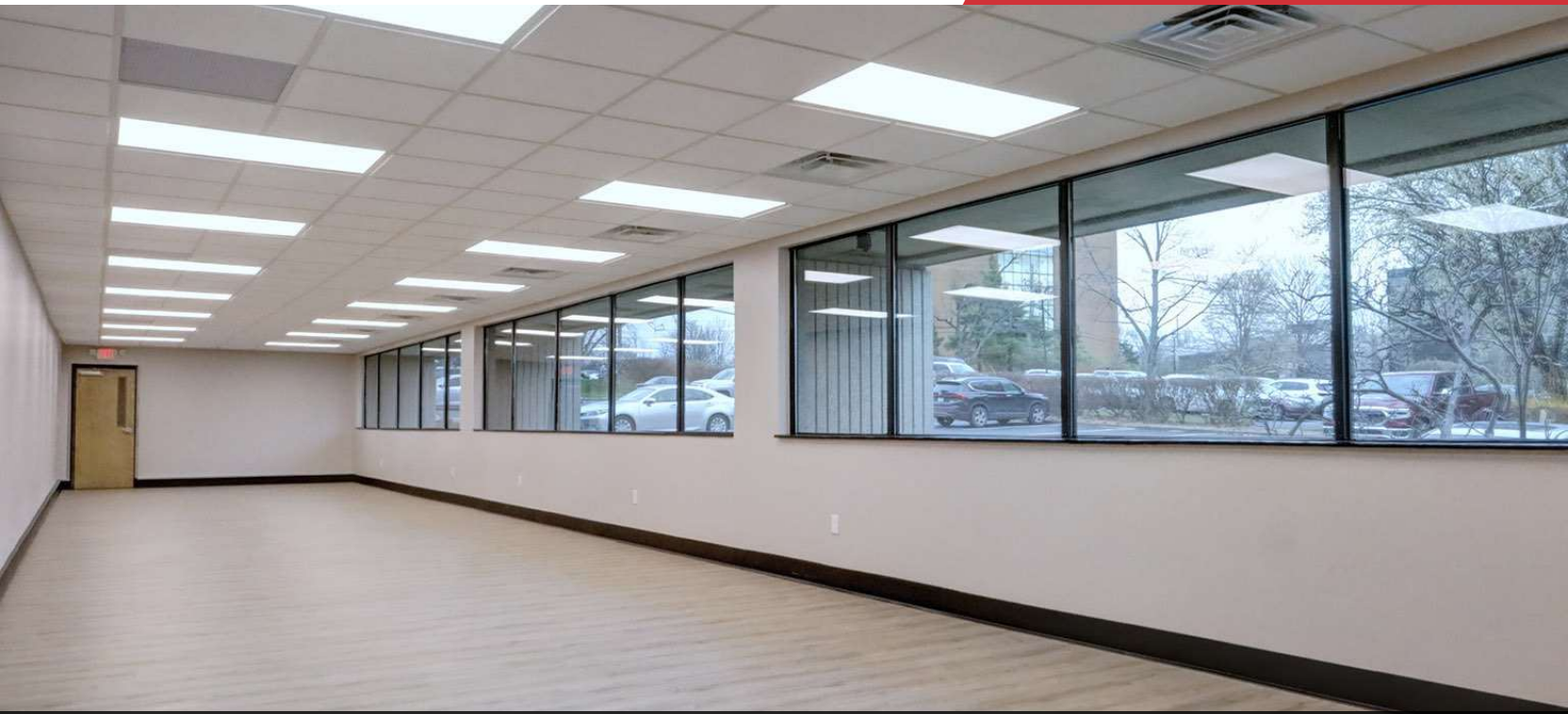
Suite 120 - Existing Layout