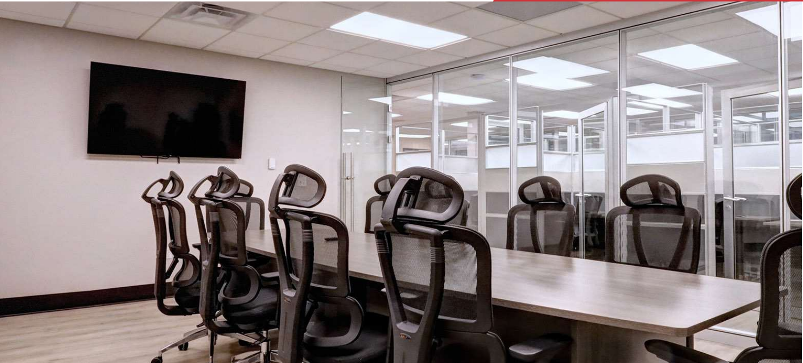
Suite 120 - Potential Fit-Up to Suite Tenant