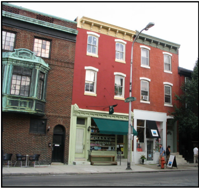
Table 14-701-3: Dimensional Standards for Commercial Districts