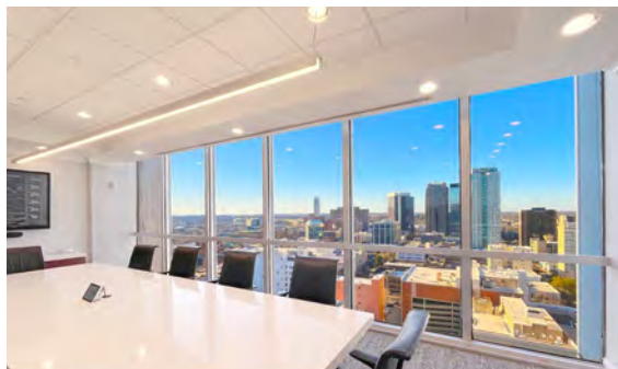
Unparalleled Scenic Views of UAB and CBD