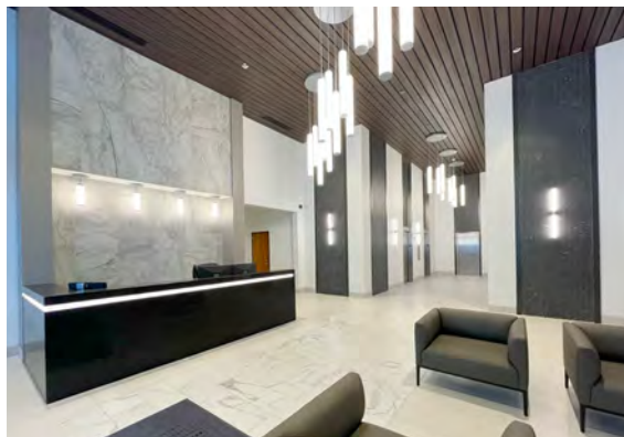
Fully Renovated Lobby