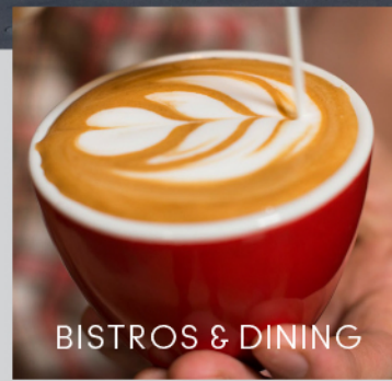
BISTROS & DINING