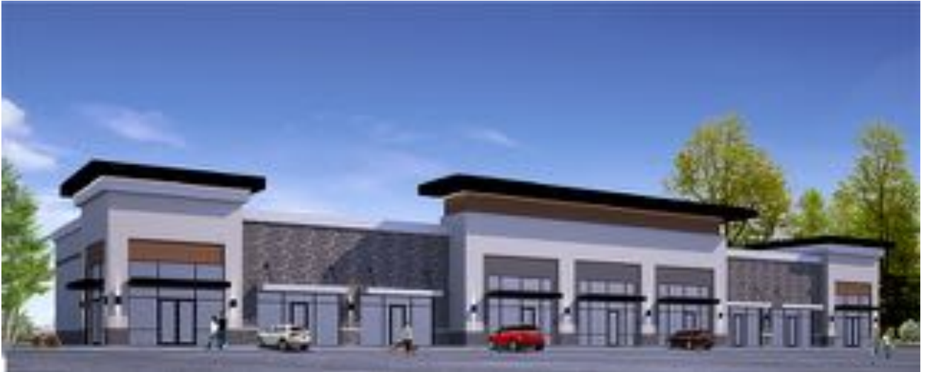
Building 1 – Restaurant/Retail – 11,602 sf