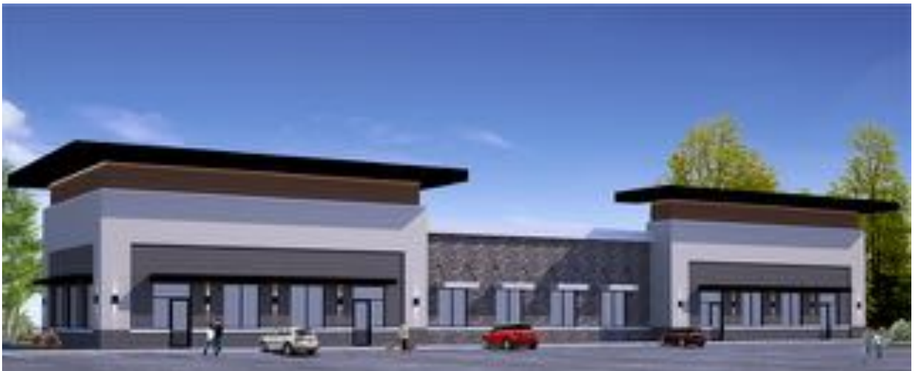
Building 2 – Medical – 5,06 sf