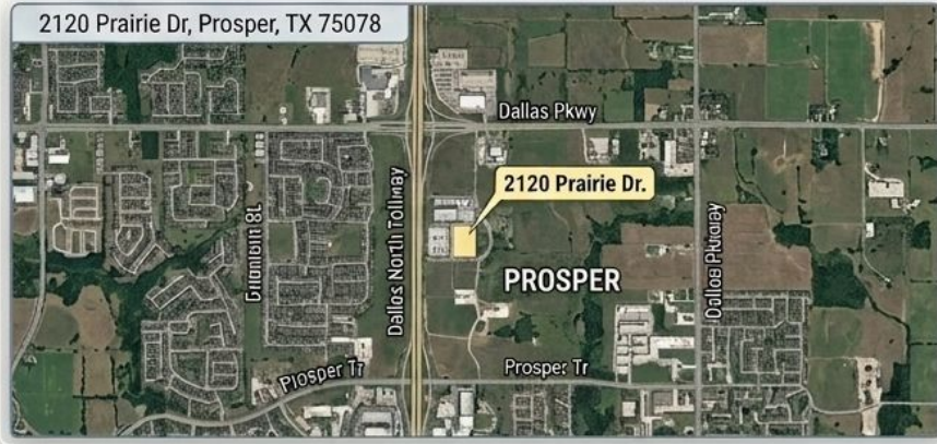
SATELLITE MAP (AERIAL VIEW)