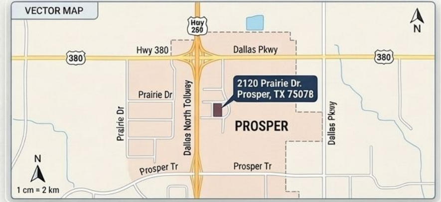
STANDARD MAP (NAVIGATION & ROADS)