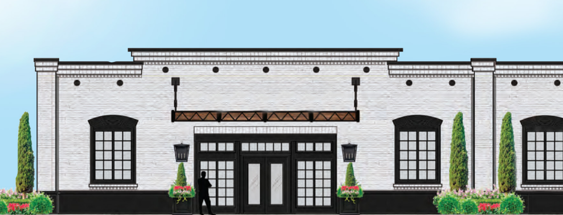
Proposed Facade Concept